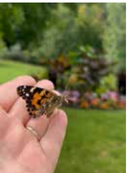
The Butterfly Release ceremony at the Pilon Family Funeral Home